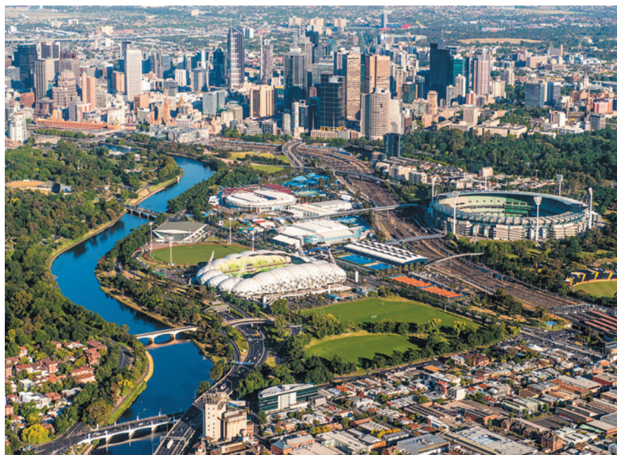
Equipping cities to weather our changing climate takes many disciplines working together.