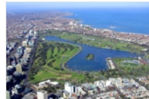
Parks Victoria mulls downsizing 18-hole golf course to enlarge Albert Park