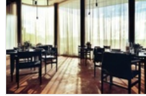
2017 Eat Drink Design Awards: Best Installation Design winner