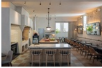
2017 Eat Drink Design Awards: Best Restaurant Design – High Commendations

2017 Eat Drink Design Awards: Best Restaurant Design winner