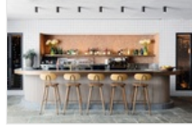
2017 Eat Drink Design Awards: Best Bar Design – High Commendations