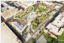
Work begins on burying 9,000m 2 Melbourne carpark under public plaza