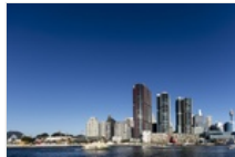
Sydney towers make shortlist of the world's best tall buildings