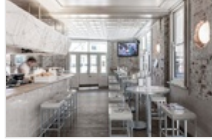
2017 Eat Drink Design Awards: Best Bar Design winner