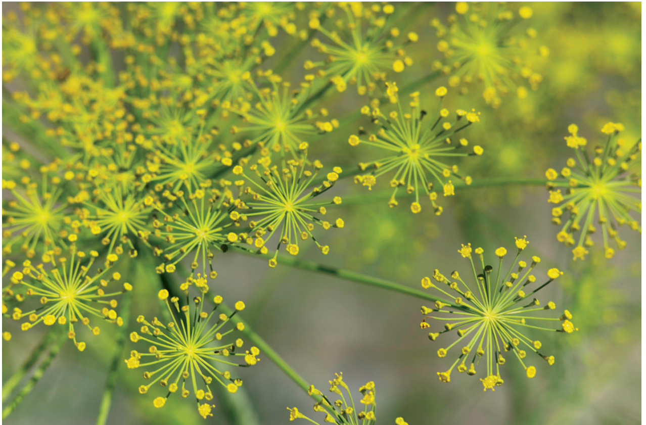
Wave Hill, Bronx, NY

Copyright © 2016 Massachusetts Medical Society.