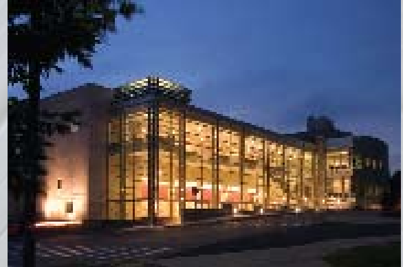
The Robert A. and Jan M. Beck Center at Cornell University