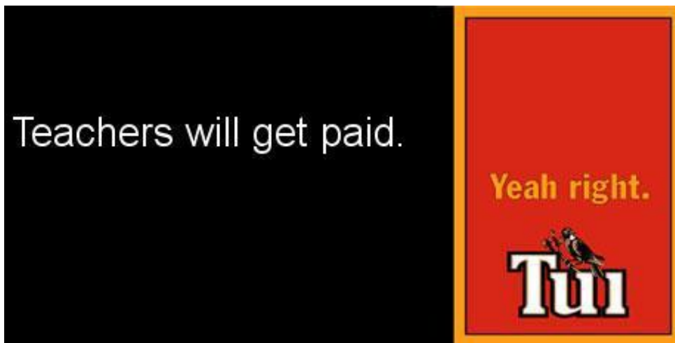
Figure 3. Outdoor billboard advertisement for Tui Beer, bringing Novopay into the brewery's satirical "Yeah Right." Campaign

A further question raised by our analysis is, why has the theme of teachers as victims continued despite the re-intermediation project? (Cynicism about their prospects is embodied in the advertisement from a local brewery, see Figure 3 below.) Does this concern arise from the level of public interest that makes Novopay a target for sustained attack, or are there also underlying relationship issues? The satirical themes, when combined with stakeholder theory, can be seen as fostering a focused sensitivity to this and other potential power-related themes for future investigation.