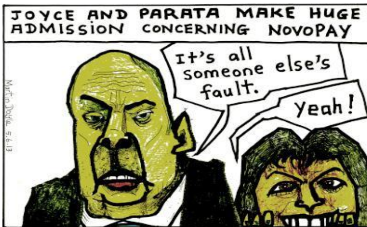
Figure 2. "Huge" admission by the key ministers involved Doyle (2013)

A further major theme introduced through the body of satire is Ministerial avoidance of blame. This is shown, for example, in Doyle's (2013c) portrayal of the two Ministers with responsibility making the "huge admission" that it is all somebody else's fault (see Figure 2), Slane's (2013) illustration of Minister Parata racing from a flaming Ministry of Education with a gas can in her hand, shouting "I didn't do it", and Hubbard's cartoon (2013a) showing Government personified as George Washington telling his father "I cannot tell a lie father, I watched them do it" as he points at the Ministry. An axe and fallen tree lies on the ground. This cartoon makes ironic reference to the myth that Washington earned the respect of his father by owning up to chopping down a cherry tree. These examples can be seen as invoking another key moral principle of stakeholder theory – that of honesty. It is widely known that politicians do their utmost to avoid blame. As two of these cartoons (Doyle and Hubbard) appeared shortly after the Ministerial Inquiry into Novopay was released, they might be seen as questioning its integrity.