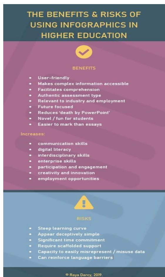
Figure 1: Infographic on the benefits and risks of using infographics in higher education.

Keywords: infographics, assessment, digital literacy, public health