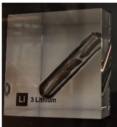
Fig. 1. Li metal.

Lithium represents 0.005 % of the earth's crust, making it the 25th most abundant element. It is primarily mined in Australia from the lithium aluminium inosilicate Spodumene [ \text{LiAl}(\text{SiO}_3)_2 ] with over 1.5 million tonnes extracted in 2017 alone, with Chile and China following next as top producers. [3] Due to its mass extraction, it is unsurprising to find lithium used in a variety of everyday materials; for instance, as an alloy with magnesium or aluminium allowing the production of strong lightweight aircraft, as lithium oxide in ceramics and glass manufacture, and as the vital component in high temperature grease (lithium stearate) that also works in Antarctic conditions (below -60^\circ\text{C} ). Most catastrophically, it is the key element in hydrogen bombs – with lithium-deuteride, in which the ^6\text{Li} isotope is used as the fusion fuel.