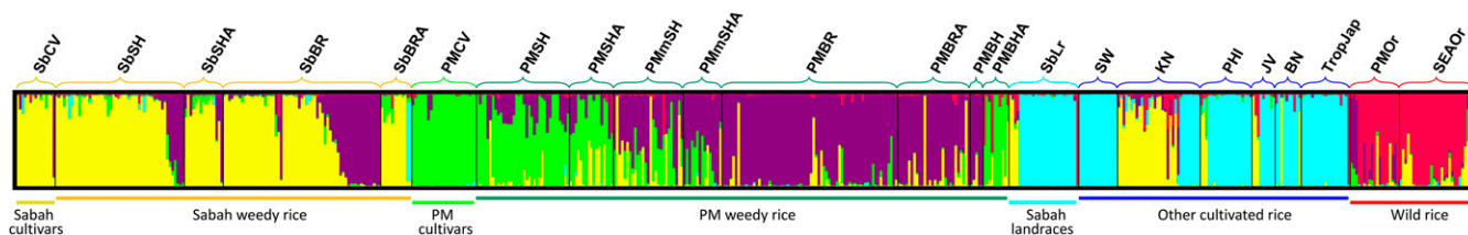
Figure 2 STRUCTURE output at K = 5 . Abbreviations used: SbCV, Sabah cultivated rice; PMCV, Peninsular Malaysia cultivated rice; SbSH, Sabah weedy rice with strawhulls and no awns; PMSH, Peninsular Malaysia weedy rice with strawhulls and no awns; PMmSH, Peninsular weedy rice with intermediate strawhulls and no awns; SbSHA, Sabah weedy rice with strawhulls and awns; PMSHA, Peninsular Malaysia weedy rice with strawhulls and awns; PMmSHA, Peninsular Malaysia weedy rice with intermediate strawhulls and awns; SbBR, Sabah weedy rice with brownhulls and no awns; PMBR, Peninsular Malaysia weedy rice with brownhulls and no awns; SbBRA, Sabah weedy rice with brownhulls and awns; PMBRA, Peninsular Malaysia weedy rice with brownhulls and awns; PMBH, Peninsular Malaysia weedy rice with blackhulls and no awns; PMBHA, Peninsular Malaysia weedy rice with blackhulls and awns; PMOr, Peninsular Malaysian Oryza rufipogon ; PMLr, Malaysian landraces; TropJap, tropical japonica ; SEAO, O. rufipogon accessions representing other Southeast Asian countries (Thailand, Cambodia and Myanmar).

Because a plot of -\ln likelihood values at successive K -values suggested that K = 5 might be a better model than K = 4 for the data (see Supplementary Figure S2A, B, C), we examined multiple run outputs at this K -value. These outputs were stable across replicate runs, and inferred membership assignments for previously-analyzed accessions matched the earlier results (Song et al. 2014). We therefore considered K = 5 to be the biologically most realistic population number. Genetic subgroups at K = 5 are shown in Figure 2 and correspond to the following groups of accessions: (1) Sabah cultivars plus many of the Sabah weed accessions, along with indica rice landraces from Sabah and neighboring countries (yellow); (2) Peninsular Malaysia cultivars and their Peninsular Malaysia weedy descendants (green); (3) many Peninsular Malaysia weeds plus some Sabah weeds and a few wild rice accessions (purple); (4) tropical japonica rice varieties, including most landraces from Sabah and neighboring countries, along with US crop varieties and two Sabah weed accessions (blue); and (5) most wild rice accessions (red).