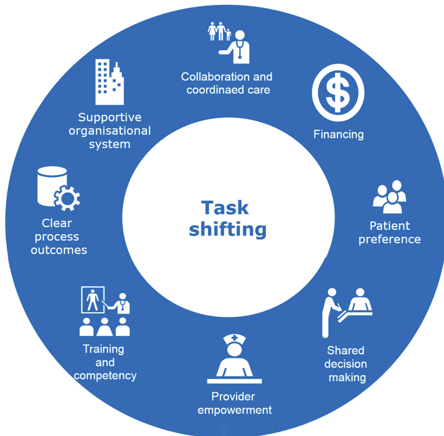
Figure 2. Elements for successful task shift.

particular when it involves role expansion. In addition, clinical supervision and support were identified as some of the important enablers to ensure the success of task shifts. Some examples include the training of nurse in nurse-led HIV/AIDS programme whereby the nurses underwent a practicum, training, supervision and mentorship with the physician prior to them providing consultation independently [34]. This is an important element in the successful implementation as the lack of support and training may result in them becoming apprehensive towards the new set of responsibilities they are expected to perform [35].