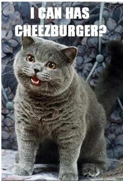
Figure 1. “I can has cheezburger?” cat 5 .