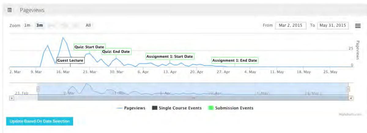
Figure 2: A three-month visualisation of access to a course content item aligned with key learning events

The content section displays all students' interactions with the content material in the course. Teachers can elect to see the total number of student views for each item of content material within the course structure, per week and aggregated across the whole course. Teachers can also elect to see "unique student views" which shows how many unique students viewed each item of content material (either per week or in total aggregate). From either of these two sets of data teachers can access further details on any specific item of content. Figure 2 shows this more detailed view for a course content item. It and shows how the level of student access can be visualised in relation to key learning events over a three-month period. Teachers also have the option with this detailed view to see a histogram of access frequencies, and a list of students who have not yet accessed the particular item of content.